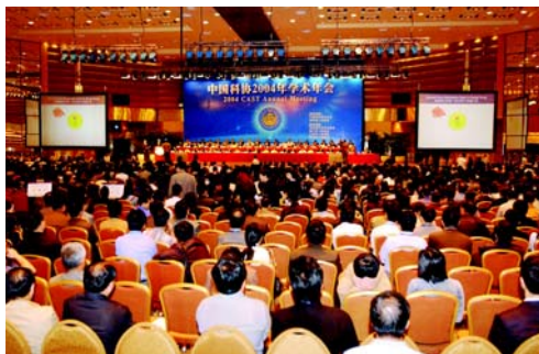
2004 CAST Annual Meeting

The China Association for Science and Technology (hereinafter referred to as CAST) is a mass organization for scientific and technological workers of China. It serves as a bridge and link between the nation's scientific and technological workers and the government of the People's Republic of China and an important driving force for the development of science and technology.