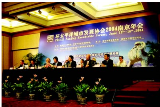
PRCUD Nanjing Roundtable Forum, June 13th -16th, 2004