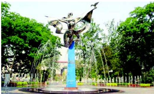
Statue of the Goddess of the Peace