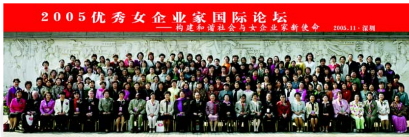
2005 International Symposium of Eminent Women Entrepreneurs

Looking forward to the 21st century, CAWE will further strengthen its work dynamics based on the past 20-year experiences. Facing the challenge of globalization and a new economy, it will broaden exchanges and cooperation with international women organizations, and strengthen the ties and interactions between women entrepreneurs nationwide, thus, in the new situation after China's entry into WTO, helping the women entrepreneurs in China remain in the forefront of economic development.