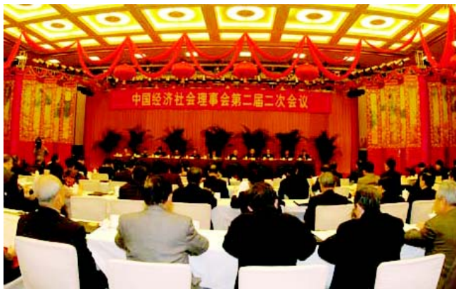
The 2nd Boarding Meeting of CESC