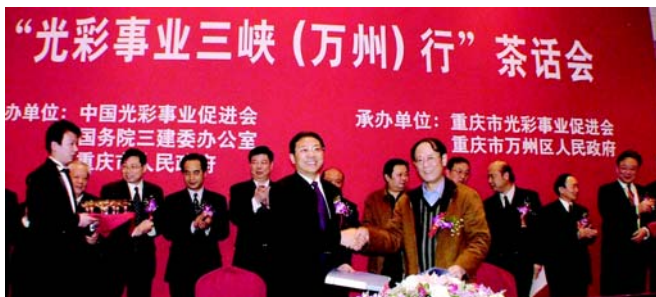
Tea Party on “Guangcai Program in Sanxia (wan Zhou)”

In 1994, 10 private entrepreneurs signed jointly a written proposal to call people of the non-public sector to “devote ourselves to the anti-poverty Guangcai Program” in the second session of 7th National Committee of the All-China Federation of Industry and Commerce, which set a solid foundation for the establishment of the China Society for Promotion of the Guangcai Program (hereinafter referred to as CSPGP).