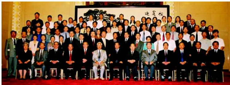
The 5th Council Meeting of CGF

China Green Foundation was sponsored jointly by all circles of the society and announced establishment by convention of the first council meeting on September 27, 1985. It is a national public foundation registered at the Ministry of Civil Affairs.