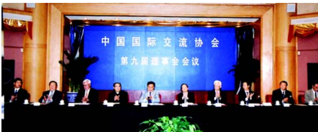
The 9th Council Meeting of CAFIU

Founded in September 1981, the Chinese Association for International Understanding (CAFIU) is sponsored by and composed of political parties, social organizations, prominent personages, scholars and social activists from all walks of life in China. CAFIU, aiming at enhancing mutual understanding and friendship between China and other countries, safeguarding world peace and promoting common development, has been carrying out active and wide-ranging international non-governmental exchanges and dialogue in the hope to “Let the world understand China, and let China understand the world”.