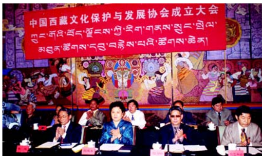
Inauguration Ceremony of CAPDTC

As a national non-profit public body with an independent legal person status, China Association for Preservation and Development of Tibetan Culture is a non-governmental organization consisting of volunteers both at home and abroad who love Tibetan culture and care for its preservation and development.