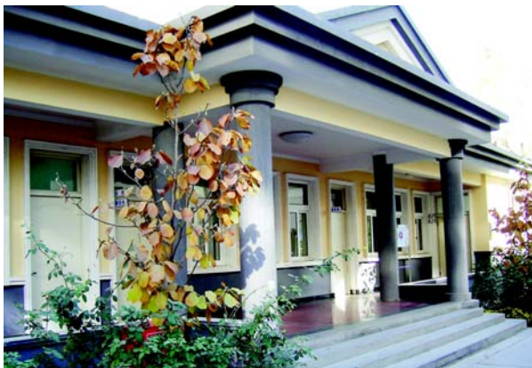
Office Building of CACDA