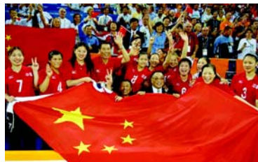
President Deng Pufang and the Female Volleyball Players in Athens 2004 Paralympic Games