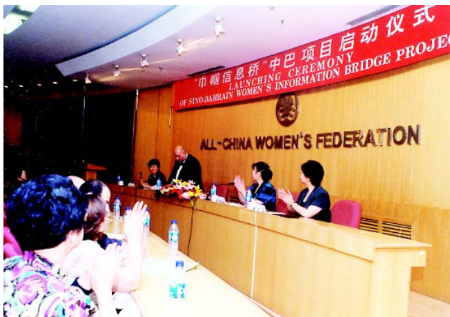
Launching Ceremony of Sino-Pakistan Women's Information Bridge Project

The All-China Women's Federation (ACWF) was founded on April 3, 1949. It is a mass organization for the advancement of Chinese women of all nationalities in all walks of life. The mission of ACWF is to represent and safeguard women's rights and interests and to promote equality between women and men.