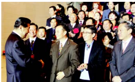
Awarding Ceremony for the 10th Anniversary of the Implementation of the Warmth Project

The National Association of Vocational Education of China (NAVEC) was founded in Shanghai in 1917. It is a nationwide mass educational organization composed mainly of personages in the educational field, as well as those in economic, scientific and technological fields who concern themselves with vocational education.