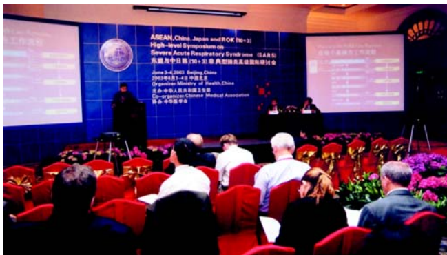
ASEAN, China, Japan and ROK High Level Symposium on Severe Acute Respiratory Syndrome (SARS), Beijing, 2003

The Chinese Medical Association (CMA) is a non-profit academic organization voluntarily formed by medical science and technology professionals dedicated to the advancement of medicine in China. The CMA is an important social force in the development of medical science and technology.