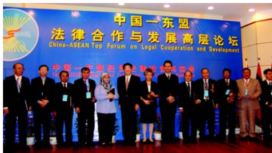
China-ASEAN Top Forum on Legal Cooperation and Development

As a nationwide social and academic body of juridical circle and judicial circle, the China Law Society (CLS) serves as a bridge and link by which the jurists and law practitioners established ties with the society and the masses. In order to promote legal research, CLS has mobilized and urged the jurists and law practitioners to take part in the activities of drafting, implementation of laws, the adminis-