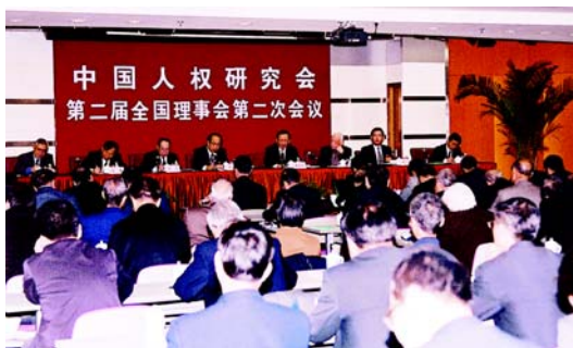
The 2nd National Council Meeting of CSHRS

Initiated by scholars and experts concerned with human rights at nine Beijing-based schools of higher learning and research institutes, the All-China Federation of Trade Unions and the All-China Women's Federation, the China Society for Human Rights Studies (CSHRS) was founded in January 1993. It is the largest academic organization specializing in human rights studies in China, and a national non-governmental organization