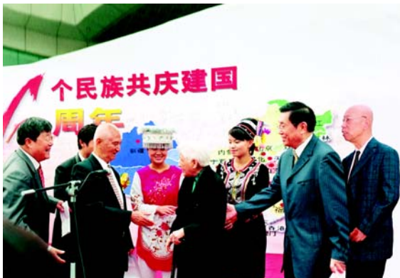
Directors of China Care and Compassion Society took part in the 56th National Day celebration with minority representatives

China Care and Compassion Society (CCCS) is a non-profit making organization for public welfare, which is constituted voluntarily by public figures from all circles of China, such as science and technology, social science, religion, law, news, culture, sports, medical cure and hygiene, with the will of taking care of people's physical and mental healthy and promoting social harmonious development. CCCS was granted the Special consultative status of NGO with the Economic and Social Council of the United Nations in 2004.