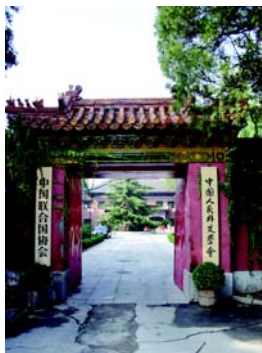
Office Building of UNA-China

The United Nations Association of China (UNA-China) is a non-government organization for the promotion of the cause of peace and development of the United Nations, with its membership open to the general public, particularly to social groups that are interested in UN affairs.