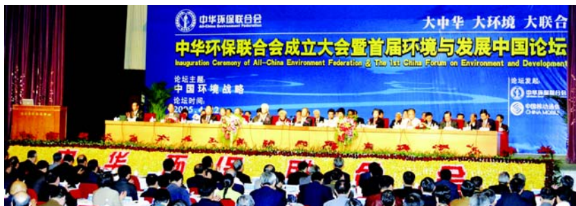
Inauguration Ceremony of All-China Environment Federation

All-China Environment Federation (ACEF) is a nationwide non-profit civil organization legally registered with the Ministry of Civil Affairs. It is composed of enthusiastic representatives from enterprises, social organizations and volunteers.