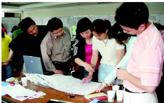
Training Program on Capacity Building to Grass Roots NGOs by CANGO

China Association for NGO Cooperation (CANGO) is a nonprofit making, voluntary, membership organization operating nationwide. CANGO was founded in 1992 and registered with the Ministry of Civil Affairs in 1993.