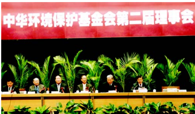
The 2nd Board Meeting of CEPF

Founded in April 1993, China Environmental Protection Foundation (CEPF) is the first non-profit NGO foundation dedicated to environmental protection in China. CEPF was granted the Consultative Status by the UN ECOSOC in 2005.